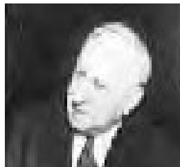
“E. M. JELLINEK” – AUTHOR OF THE DISEASE CONCEPT OF ALCOHOLISM

Recent advances in the field of “Neurology” have revealed a new insight into the disease of addiction. This very complicated medical science has brought to light some very practical understanding of addiction and of the addict and his thinking and behavior. Much is revealed when you see drug addiction as a DISEASE OF THE BRAIN!